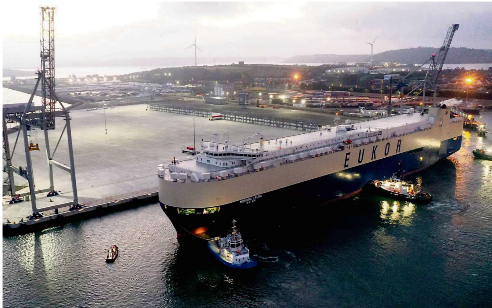
One of the world's largest car carriers was the first commercial vessel to dock at the new deep-water quay at the Port of Cork in Ringaskiddy. The Morning Laura, with a capacity to transport 8,000 vehicles, docked in the port for over eight hours to discharge 682 vehicles.

In September 2019, then Solidarity TD Ruth Coppinger highlighted the issue in the Dáil, after being contacted by a tenant who had been propositioned by her landlord in lieu of rent.