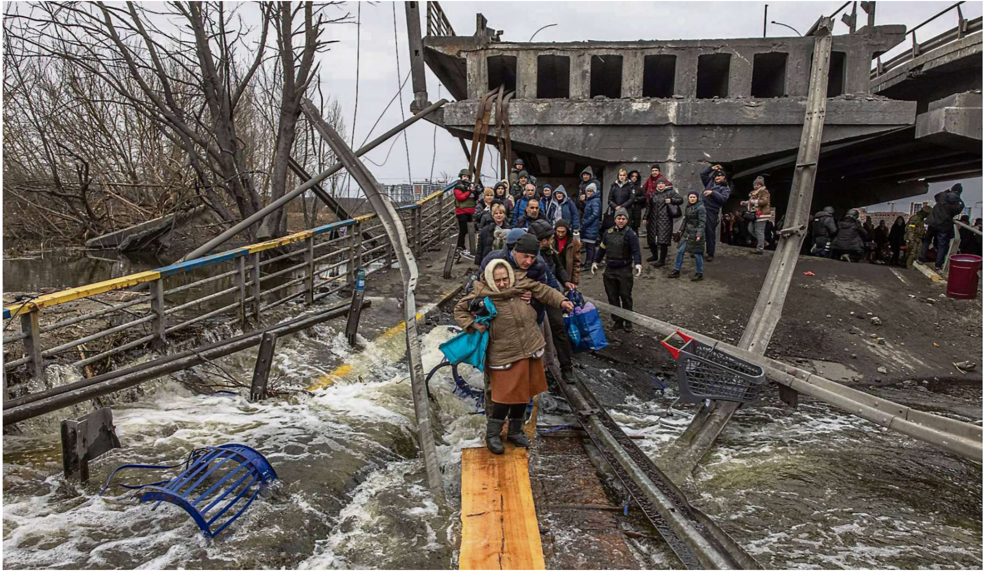
Residents of Irpin cross a destroyed bridge as they flee the frontline town.

Department of Social Protection officials will have a presence at airports, along