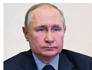
Hacker group is sympathetic to Vladimir Putin.

lish translations of the files. The Irish Examiner understands that a team of detectives in the Garda National Cyber Crime Bureau (GNCCB) are trawling through the files and are hopeful of gaining further knowledge and evidence.