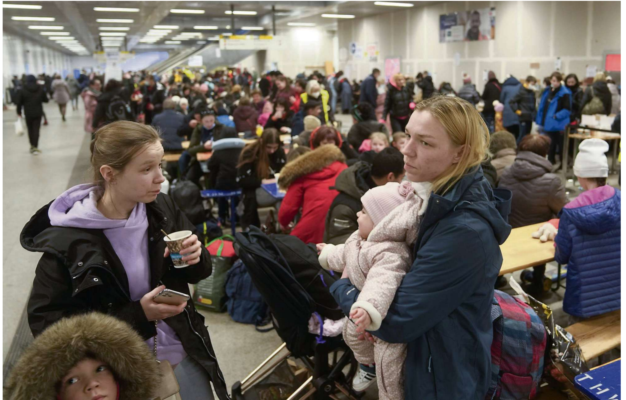
Two women with their children rest in a subway hall after fleeing from Ukraine at the main train station in Berlin.