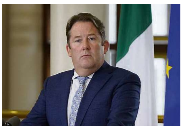
Darragh O'Brien: Awaiting advice on whether sex-for-rent ads are covered by existing legislation.

One of the properties unearthed by the Irish Examiner is a house in Newcastlewest, Co Limerick, which would be shared with the landlord. He advertised a room in his house for a single