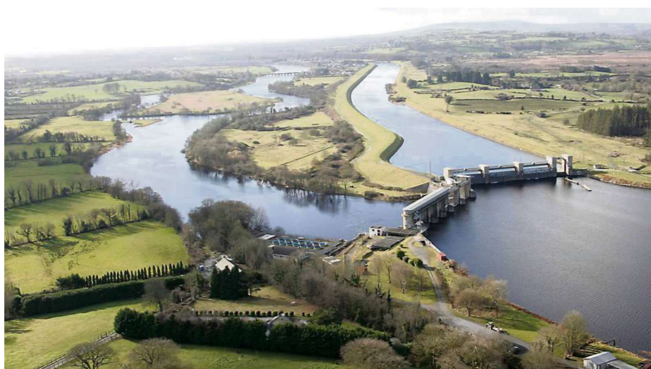
The Ardnacrusha power station was constructed during the first ten years of the Irish Free State, when it provided 80% of the power required by the nation.

This was particularly important because the majority of coal used in Ireland at that time was imported from Britain. While "energy security" wasn't a term used at the time, the idea of