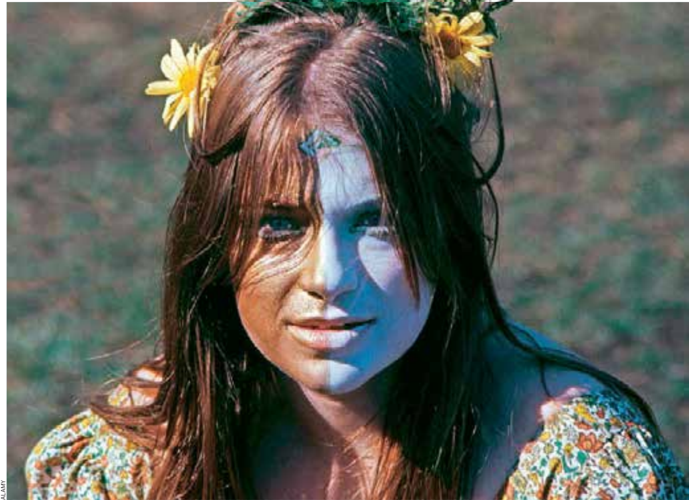
Flowers in her hair Easter Be-in, Central Park, above, and Haight-Ashbury in San Francisco, 1967, below