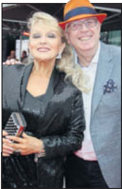
No luvvie lost . . . ex-pals