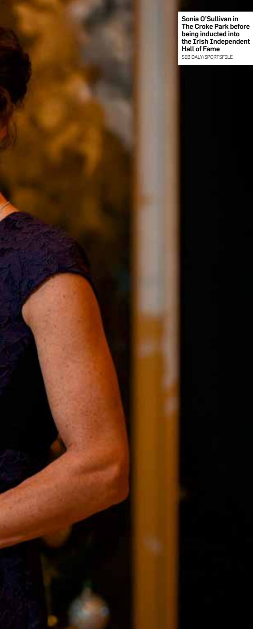
Sonia O'Sullivan in The Croke Park before being inducted into the Irish Independent Hall of Fame

was just a photo-opportunity for them. And that's when you kind of realise it's all a game. Because nothing was properly organised, everything was kind of last-minute." O'Sullivan's suspicion today is that, at the highest level of the Council, her name was always going to be more important than her input. She came under pressure in London to commit all of the medalists to a formal OCI homecoming when none had been pre-arranged. With most athletes having already made their own, individual arrangements, the OCI event had to eventually be postponed. Did she feel used? "At the end of 2012? Yeah. We never discussed it. Like I had a role to play, but it wasn't an administrative role. It was more a connecting role with the athletes. And I felt good about that role because I wasn't that far away from being an athlete myself, so I understood everything they needed. I got really positive feedback from the athletes. "But that's one of the reasons, I decided against doing it in Rio. I just felt I hadn't been involved up to that point and, all of a sudden, you get thrown in.