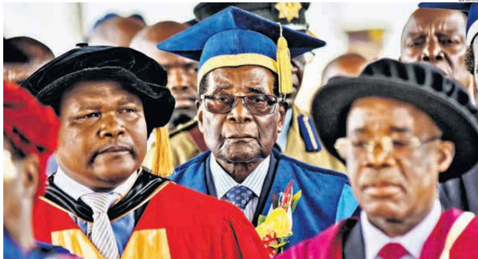
Freedom by degrees Robert Mugabe emerged from house arrest yesterday after negotiations with military chiefs to preside at a graduation ceremony in Harare. Page 30